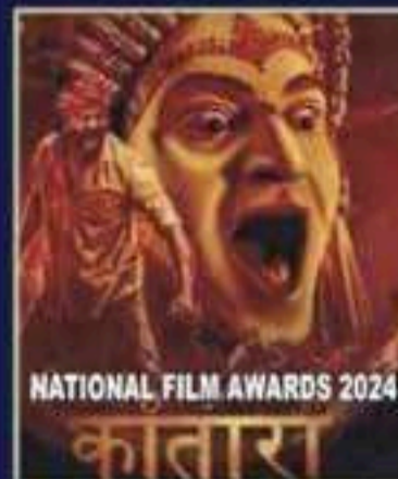
NATIONAL FILM AWARDS 2024