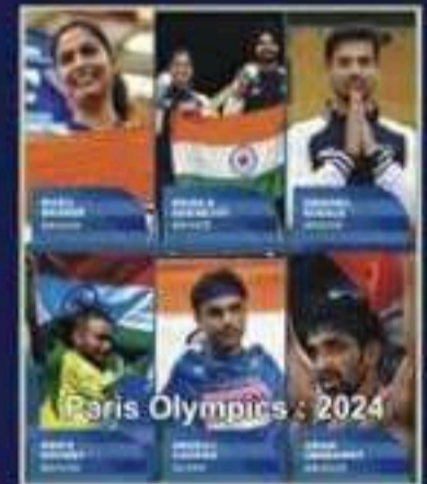
Paris Olympics : 2024