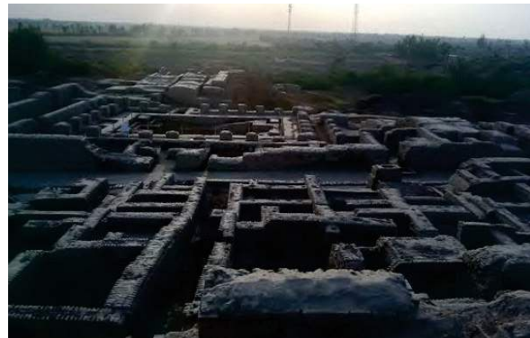
IMAGE 3.1: REGULARITY OF STREETS AND BUILDINGS SUGGESTS URBAN PLANNING IN MOHENJO-DARO.

removed for cleaning) were constructed at regular intervals by the side of the streets for cleaning. The drainage was made from burnt bricks which were smoothed from inside. This shows that the people were well acquainted with the science of sanitation.